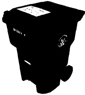
One 96 gallon cart for trash

Collected with lift arms on trucks like these