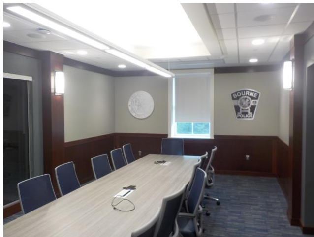
Conference Room Upper Level