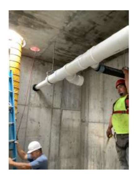
\\wse03.local\\WSE\\Projects\\MA\\Bourne MA\\2191109 Buzzards Bay WWTF - CA and RR Services\\Monthly Committee Meetings\\091420 Meeting.docx