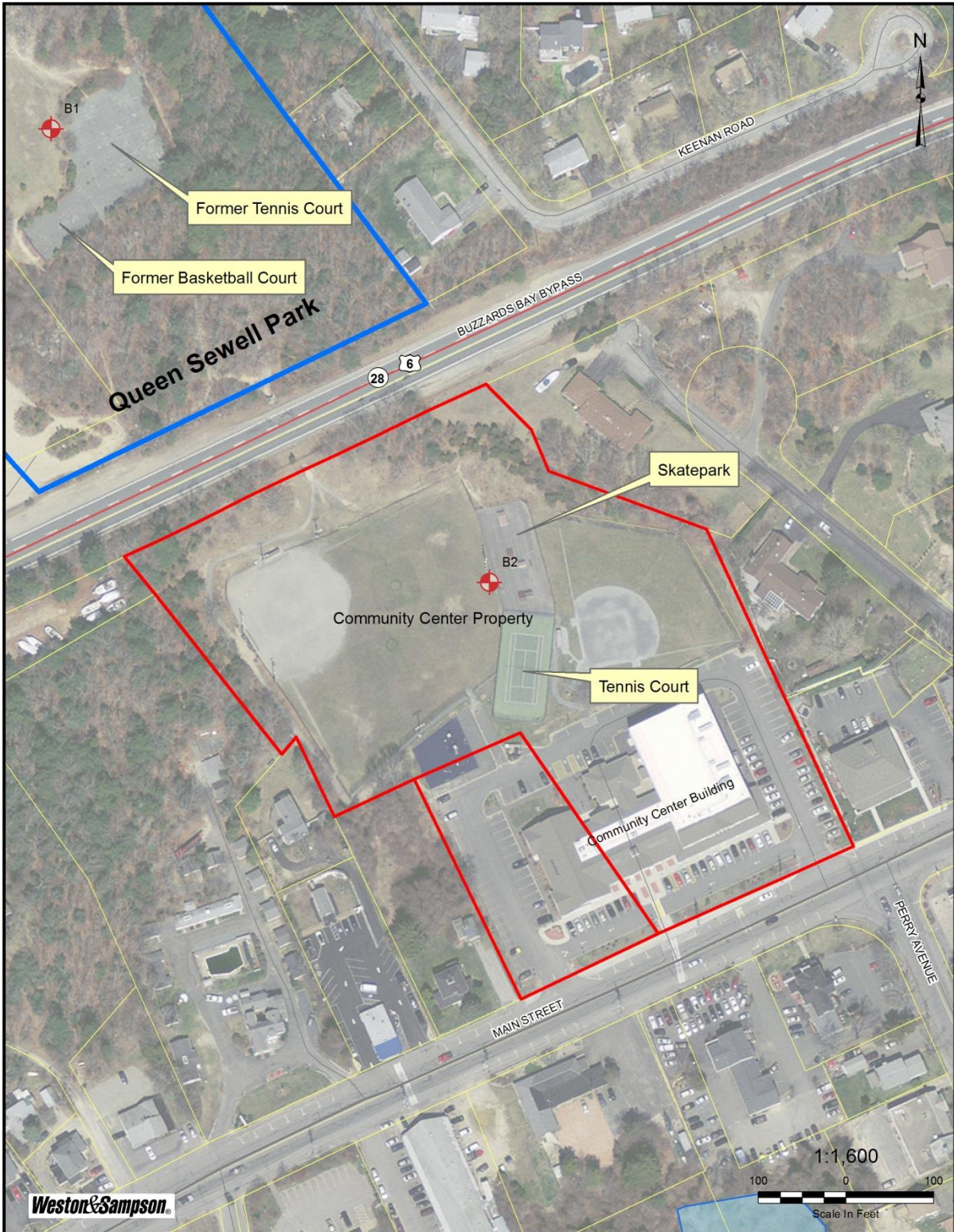
Figure 1: Community Center Site Map