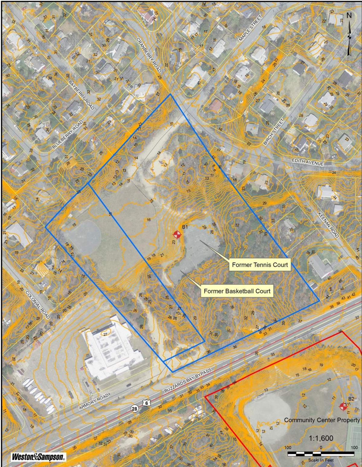
Figure 2: Queen Sewell Park Site Map