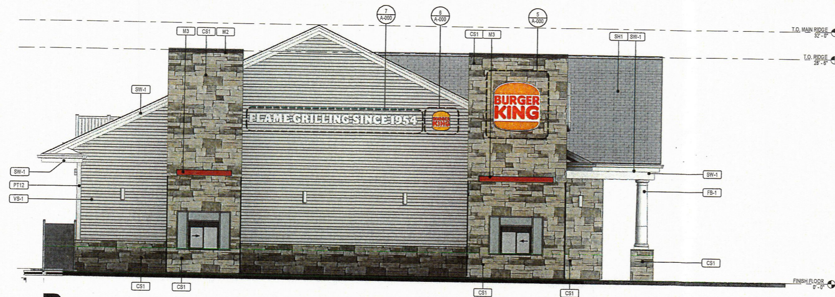
B EXTERIOR - LEFT, SD 3/16" = 1'-0"