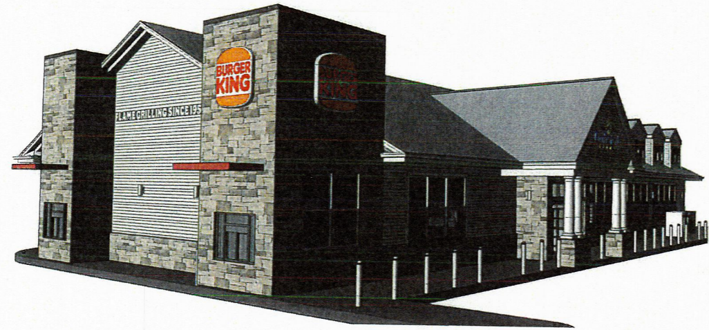
D FRONT PERSPECTIVE, SD