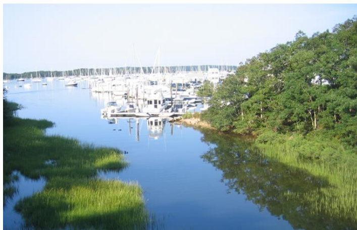
Photo: Red Brook Harbor, Credit: Buzzards Bay National Estuary Program

NEIWPCC: New England Interstate Water Pollution Control Commission is a regional commission that helps the states of the Northeast preserve and advance water quality.