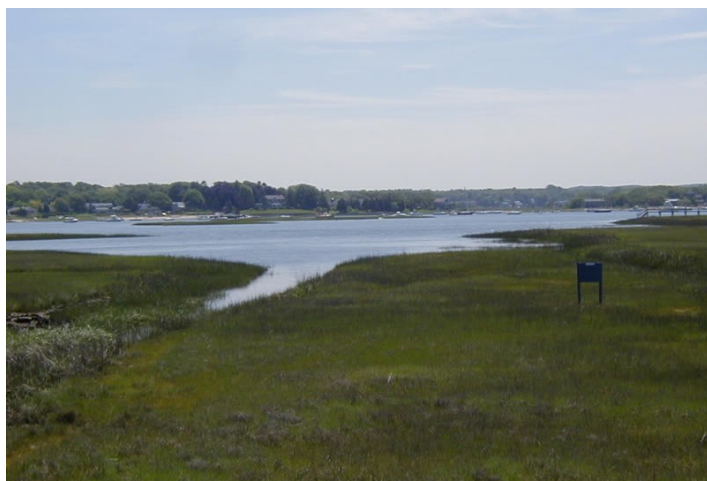
Photo: Wild Harbor

EP or EPG : Environmental Partners Group, Inc.