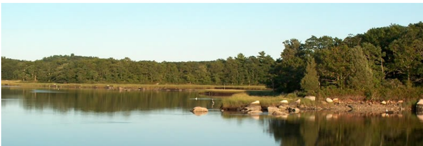
Photo: Back River, Credit: Buzzards Bay National Estuaries Program

WWTF or WWTP: Wastewater Treatment Facility or Wastewater Treatment Plant.